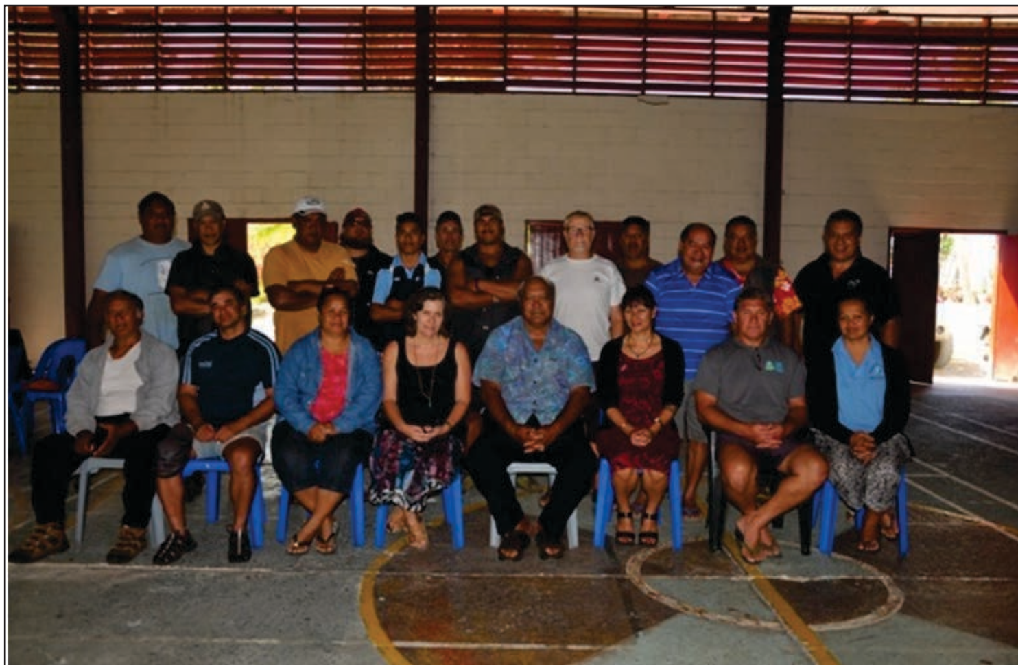
Participants to the Workshop with Minister Turepu