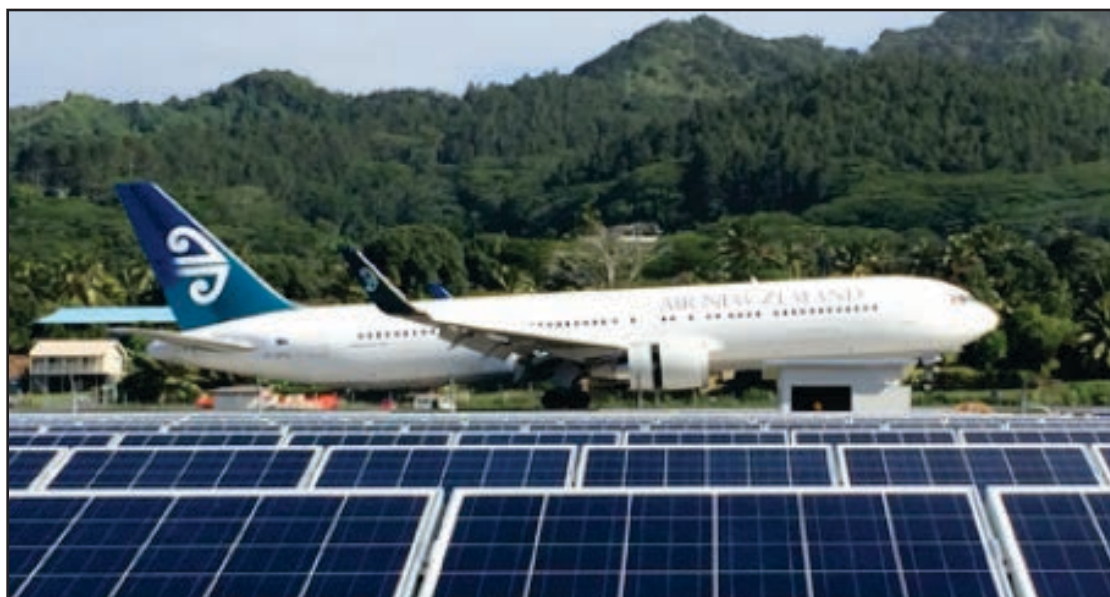
Solar panels at airport

Currently, 14% of electricity on Rarotonga sourced through solar, with the need to expand